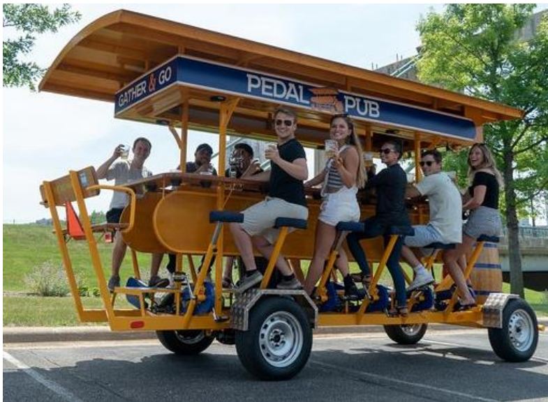
Example of a pedal pub

In North Carolina, staff found that "Pedal Pubs" operate in several cities including Asheville, Southern Pines, Durham, Raleigh, Carolina Beach, Fayetteville, Charlotte and Greensboro. The popularity of pedal pubs and other commercial low-speed vehicles has grown in the last years, with pedal vehicles becoming an attraction in many towns. Many of these vehicles also serve the purpose of providing informational tours and ride services. With the City's growth and development, it is expected that commercial pedal vehicles may see Elizabeth City as a prime spot to start commercial businesses such as historic tours, ride services, and entertainment experiences. Staff believes it is important to amend the text to create development standards for these commercial pedal vehicles.