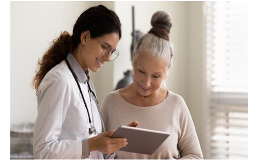
Sentara Health Plans