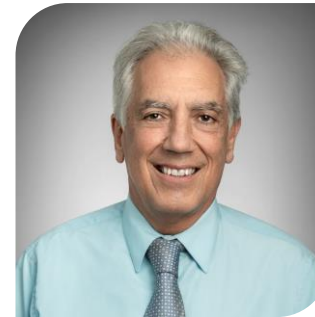
Sentara Medical Group